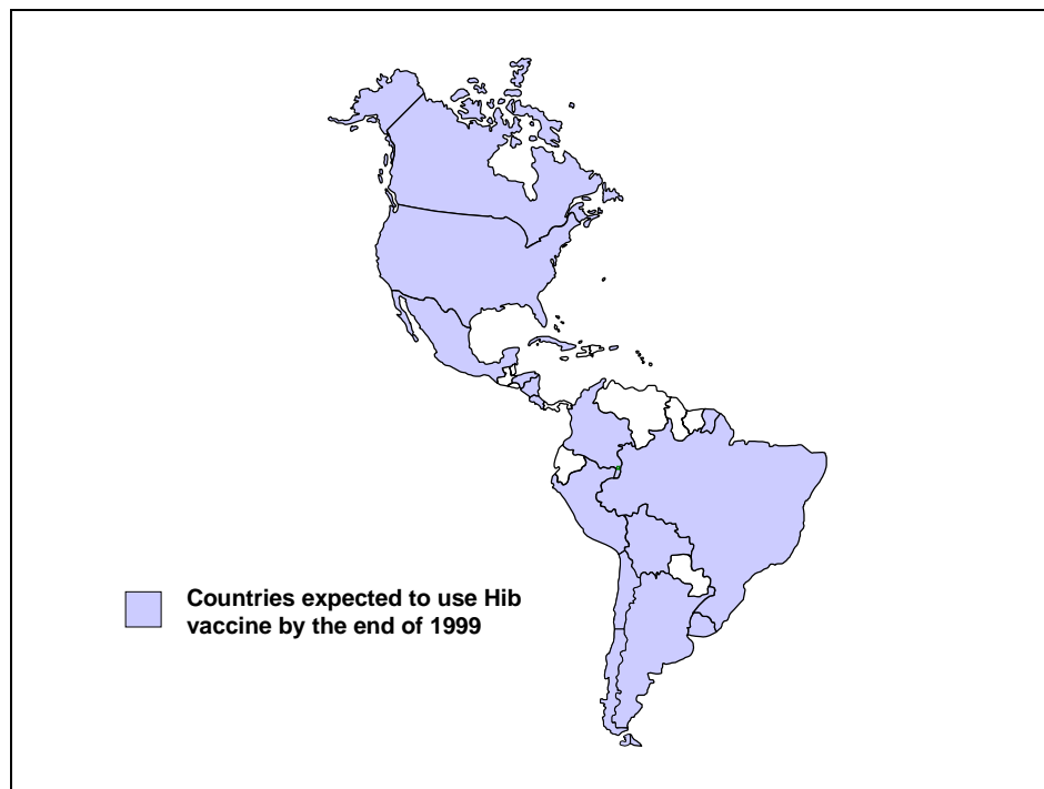
Figure 3. Hib Vaccine Utilization in the Americas by 1999

PAHO has taken a leading role in promoting the establishment of Hib surveillance in the Region and in evaluating the introduction of Hib vaccine in routine immunization programs. These initiatives have been supported by the recommendations of the PAHO Directing Council and the Meeting of the Technical Advisory Group on Vaccine-Preventable Diseases (TAG). Exchange of experiences among countries at PAHO-sponsored meetings has become an important catalyst to stimulate Hib introduction in