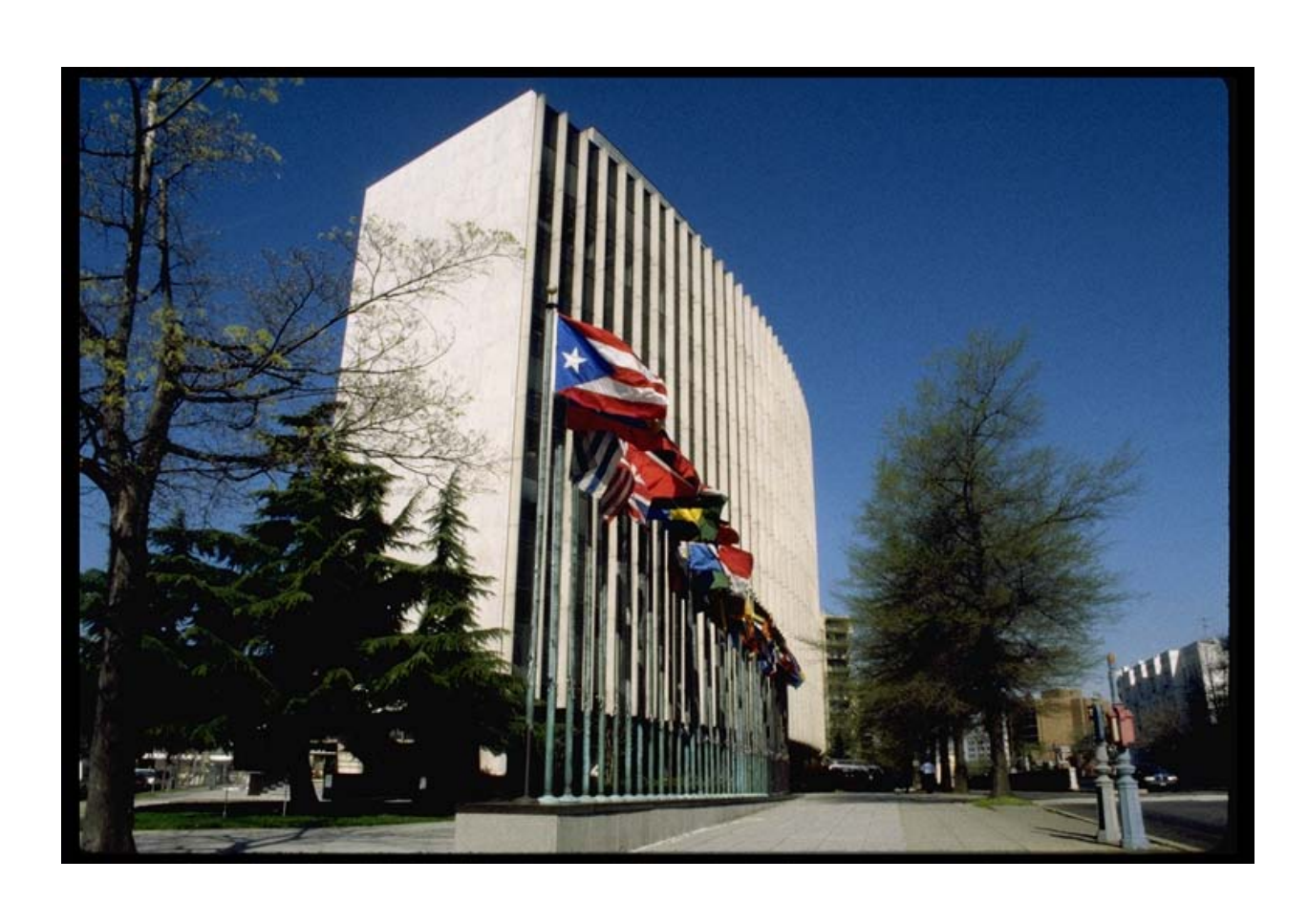
PAN AMERICAN HEALTH ORGANIZATION