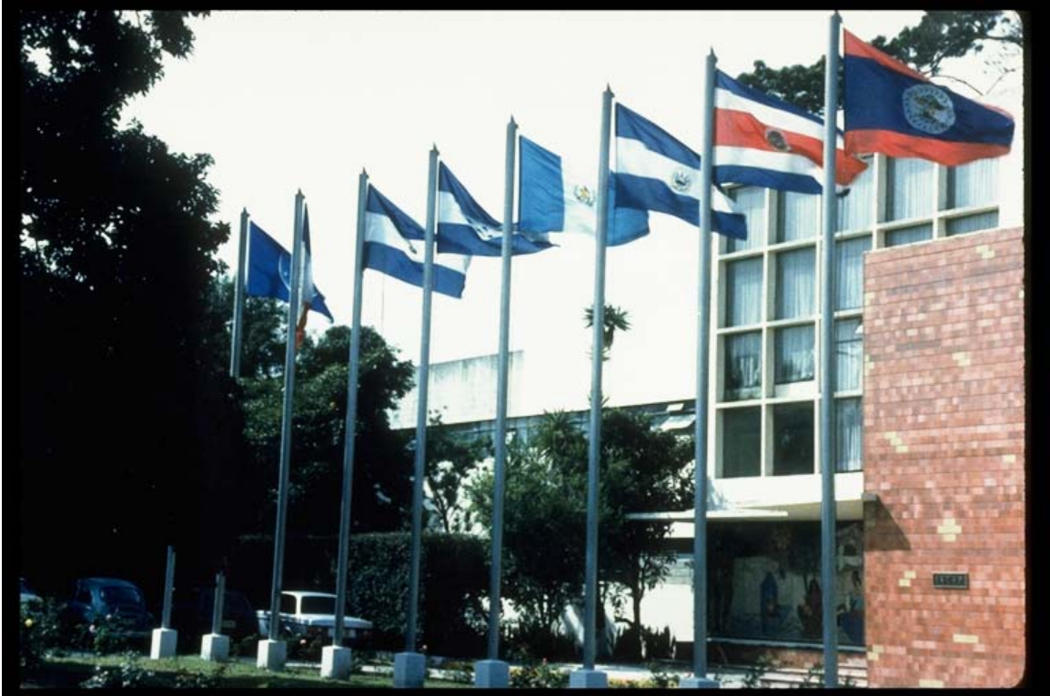
INSTITUTE OF NUTRITION OF CENTRAL AMERICA AND PANAMA